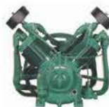
BARE COMPRESSOR PUMP